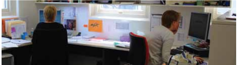
Researchers working at the NRI

Author and Reviewer Cochrane Wounds Group