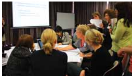
Rotating work stations

Each participant was contacted to determine their specific research needs and encouraged to bring a research idea with them to work on. On the day, they worked together to complete a workbook provided by adding information to their initial idea and developed a plan of action for progressing their research further.