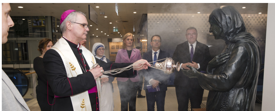
Blessing of St Teresa of Kolkata Statue, August 2023

Director, ACU Centre for Liturgy Professor of Liturgical Studies and Sacramental Theology, Faculty of Theology and Philosophy