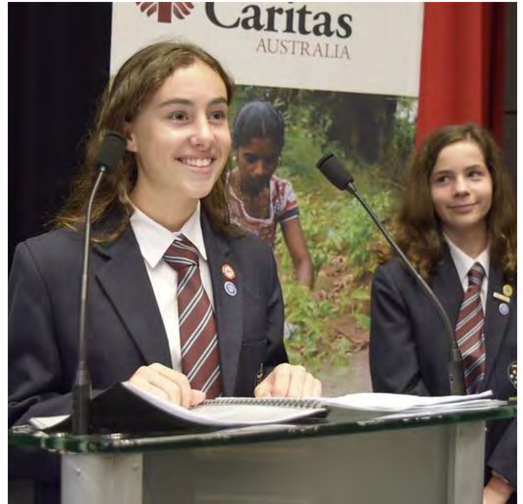
Catholic Regional College, Caroline Springs. Students reading the gospel.